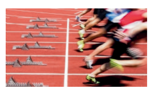
The tension between competition and cooperation in sport: applying Competition Law in a sporting context Noel Beale