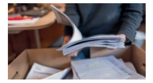
Competition dawn raids: what NOT to do Noel Beale